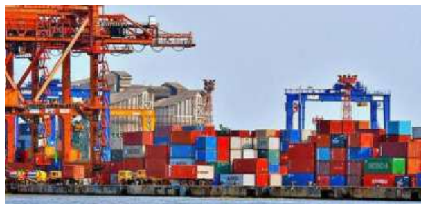
GROWTH ENABLER. The consultations are expected to provide a clearer picture of logistics and supply-chain bottlenecks affecting India's export competitiveness

The Department of Commerce is preparing detailed export strategy papers for 20 shortlisted focus markets, identifying product-specific opportunities and challenges as well as market-specific interventions as part of a broader effort to boost India's merchandise exports to $1 trillion by 2030-31.