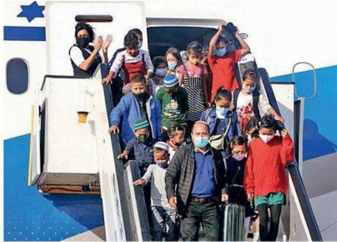
File picture of a group of Bnei Menashe from Mizoram arriving in Israel. (Right) Young members of the community in Israel