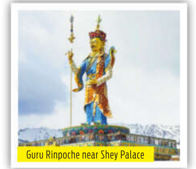
Guru Rinpoche near Shey Palace

Day three can be about descending from the quiet of Stok into Leh Market. The lanes are narrow and layered — the smell of freshly baked khambir , Ladakhi bread, cuts through the cold air. Leh Palace looms above the market: a dark-timbered nine-storey structure that appears carved directly from the mountainside. Climbing to the top of it opens into a view of the old town — a dense